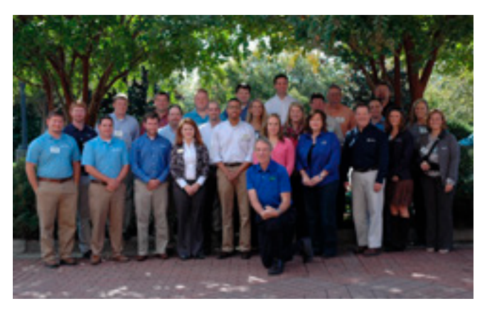
March 2013 Commercial Ag Lender Class, graduated October 2013