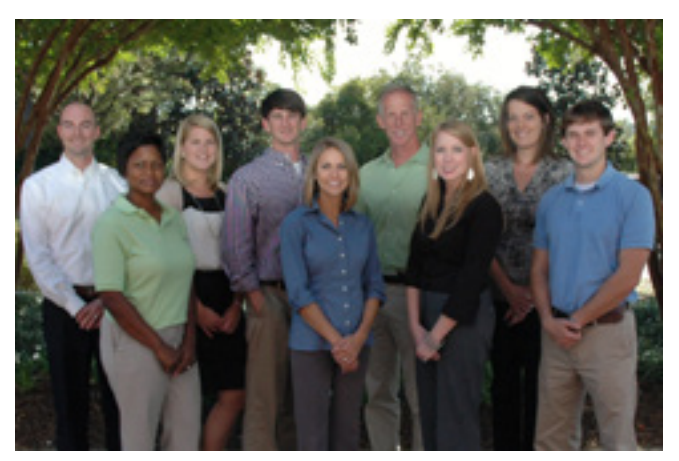
September 2012 Mastering Sales Magnetism Class, graduated February 2013