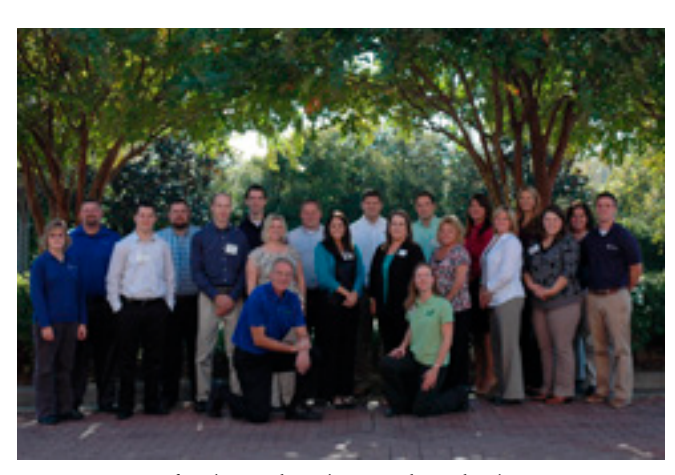
August 2012 Lifestyle Lender Class, graduated February 2013