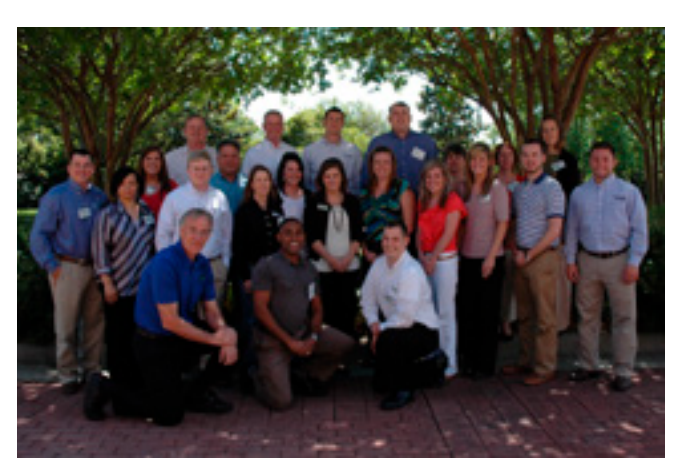
February 2013 Lifestyle Lender Class, graduated September 2013