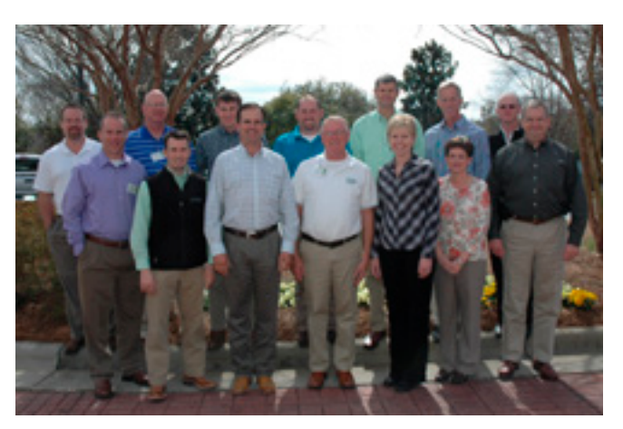
March 2013 Mastering Sales Magnetism Class, graduated August 2013