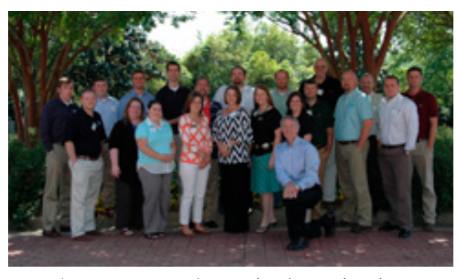
September 2013 Commercial Ag Lender Class, graduated May 2014